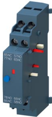
signaling switch for circuit breaker 3RV2 with screw terminal